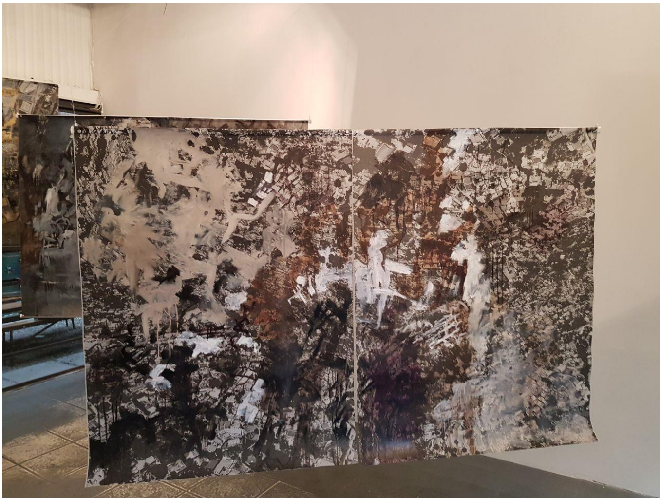
Night Landing Series Installation at 70 Juta Street Johannesburg