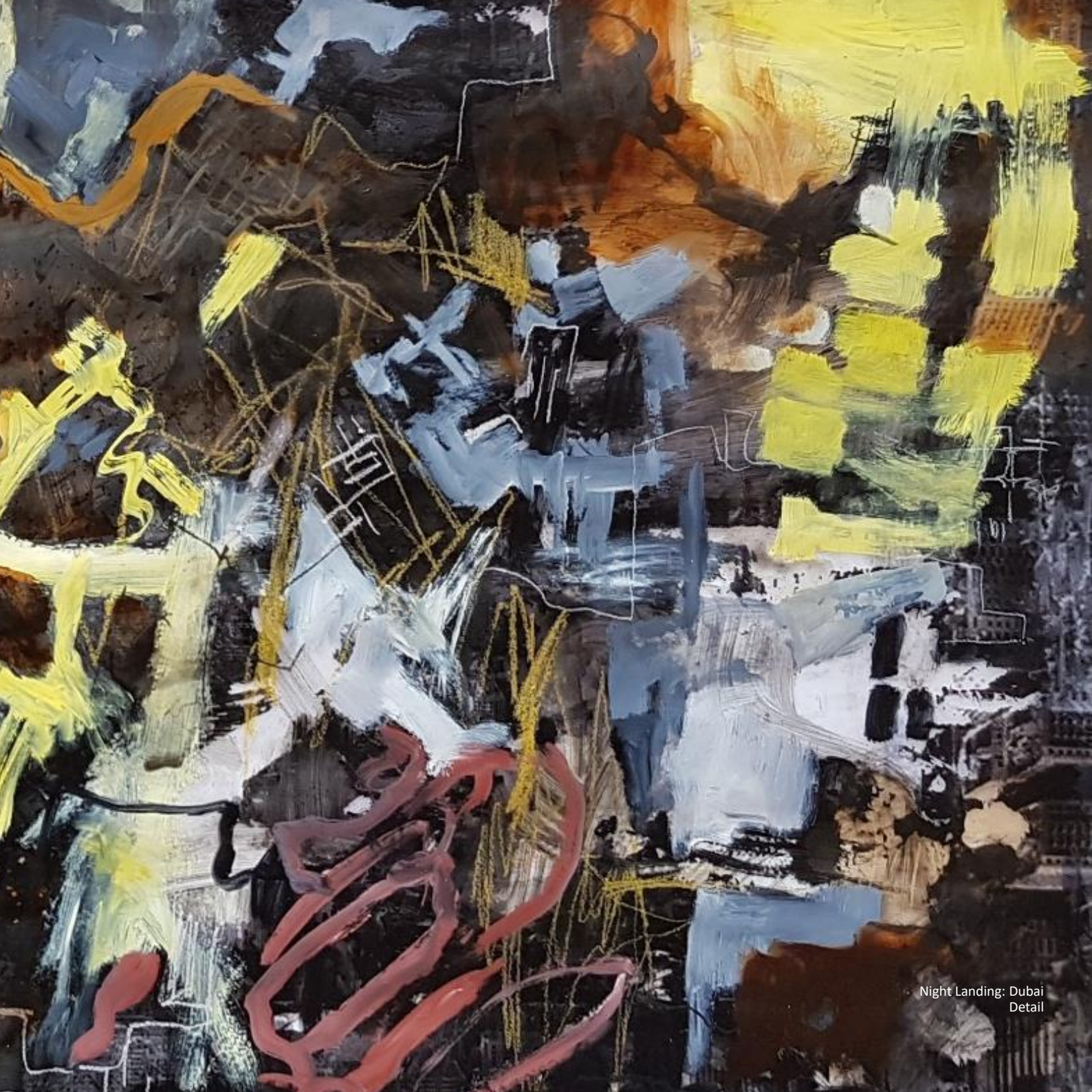
Night Landing: Dubai Detail