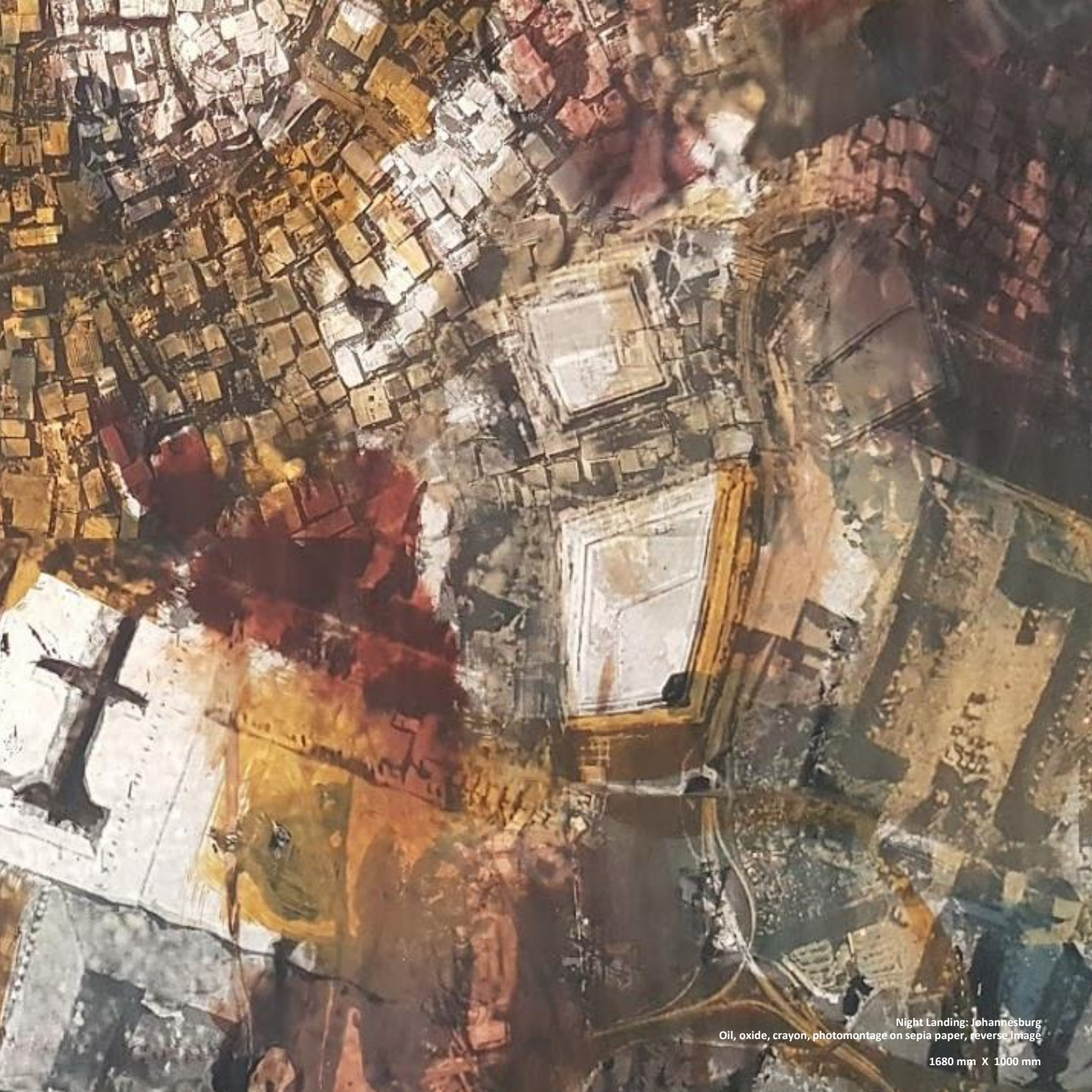
Night Landing: Johannesburg Oil, oxide, crayon, photomontage on sepia paper, reverse image