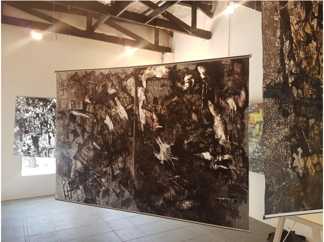
Night Landing Series Installation at 70 Juta Street Johannesburg