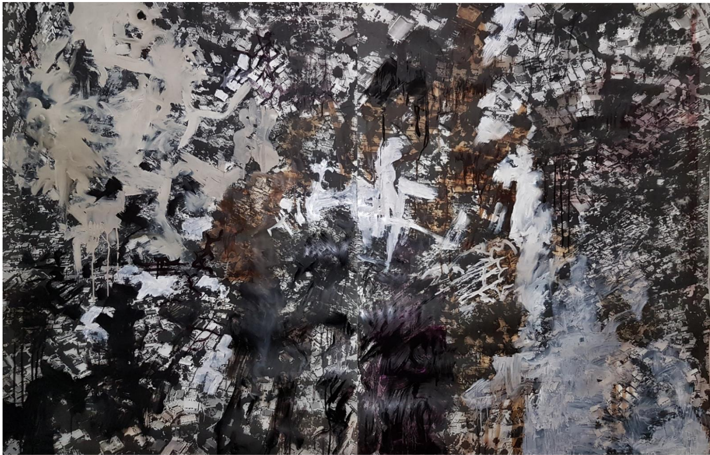
Night Landing: Dar es Salaam Oil, crayon, photomontage on sepi paper