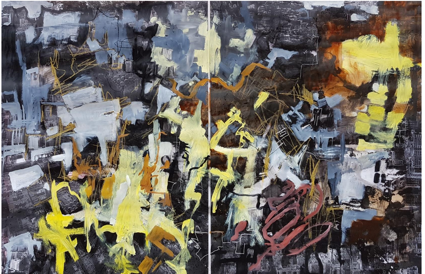
Night Landing: Dubai Oil, crayon, photomontage on sepia paper