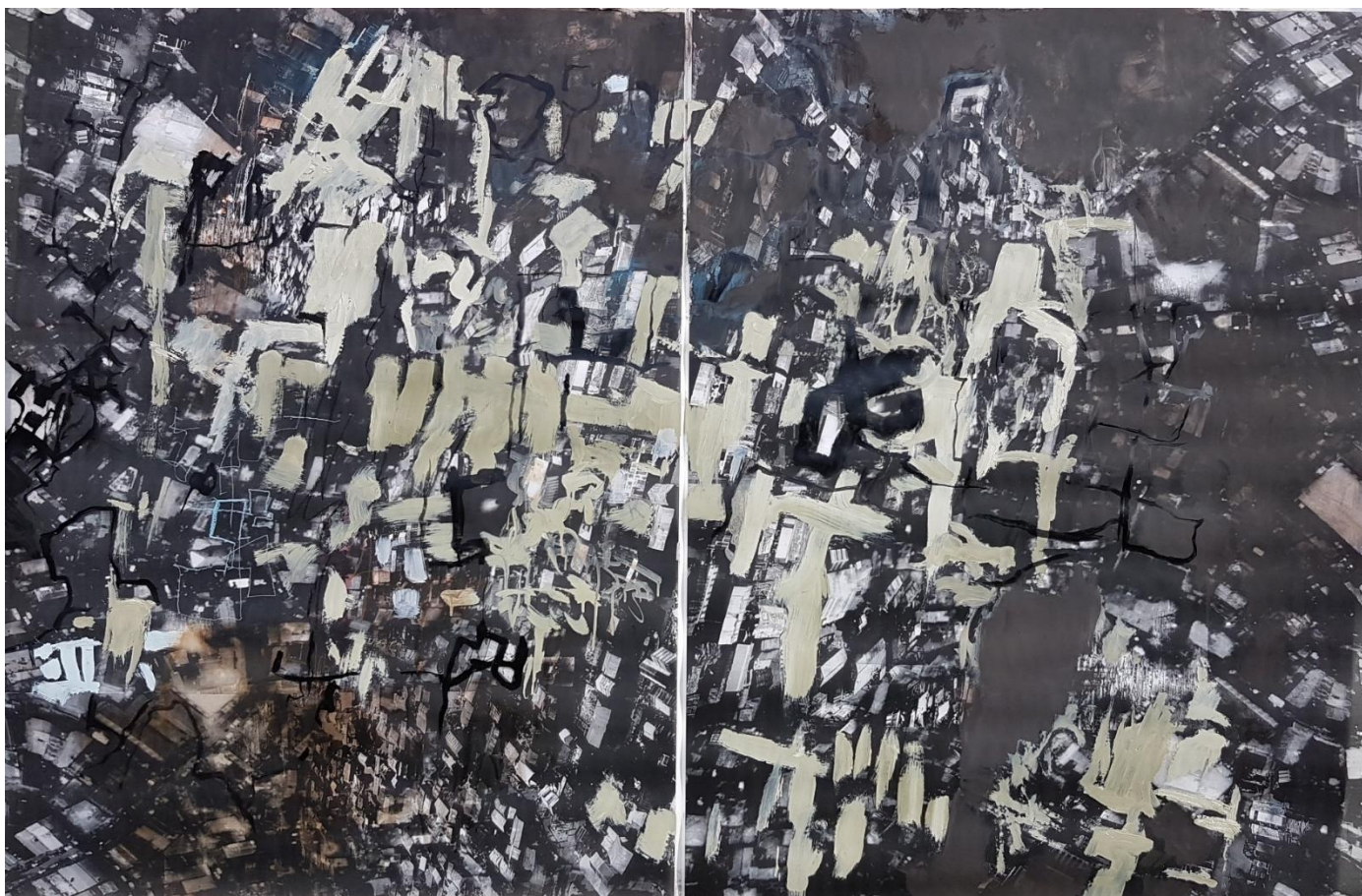
Night Landing: Lagos Oil, oxide, crayon, photomontage on sepia paper