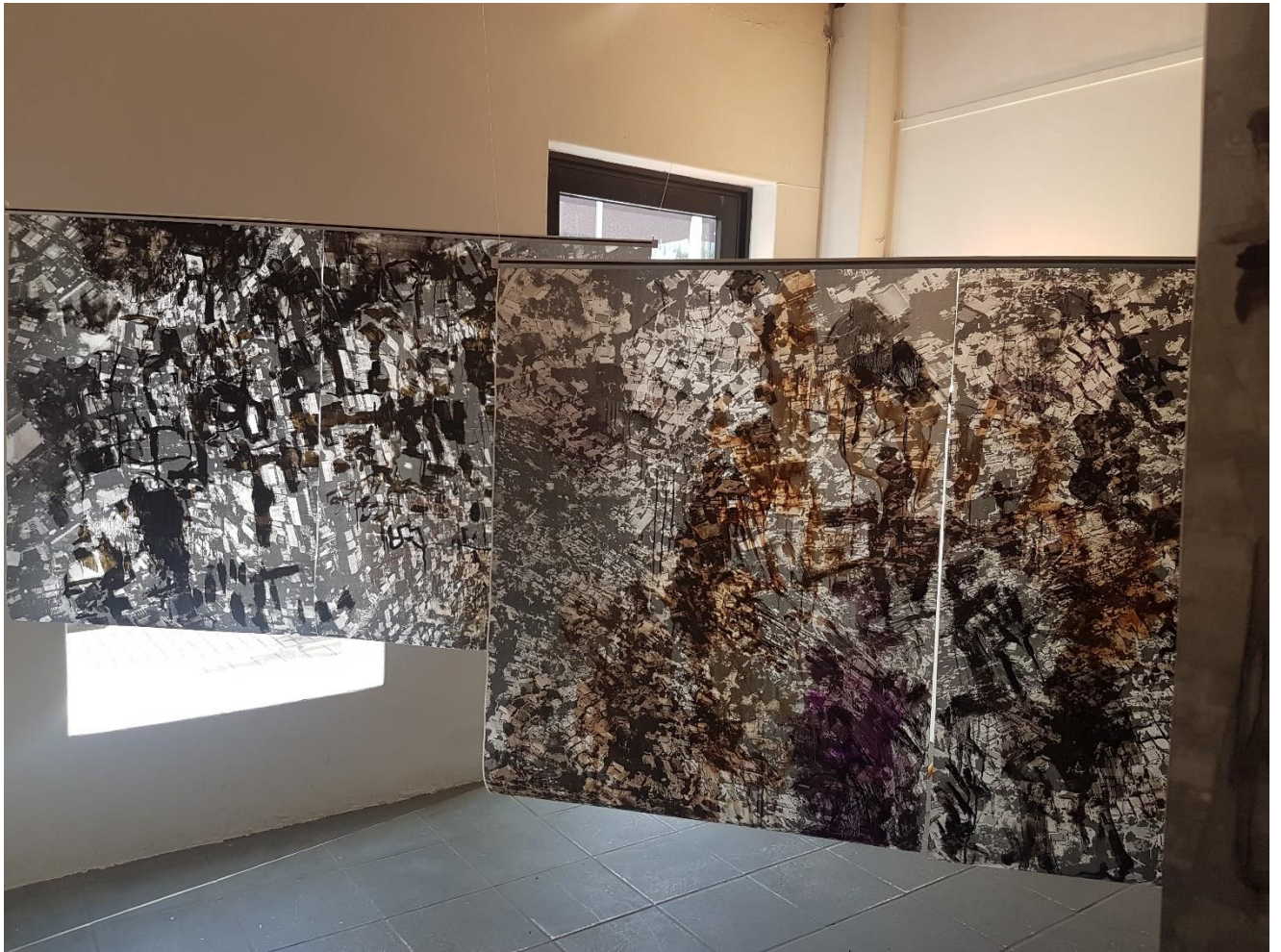
Night Landing Series Installation at 70 Juta Street Johannesburg