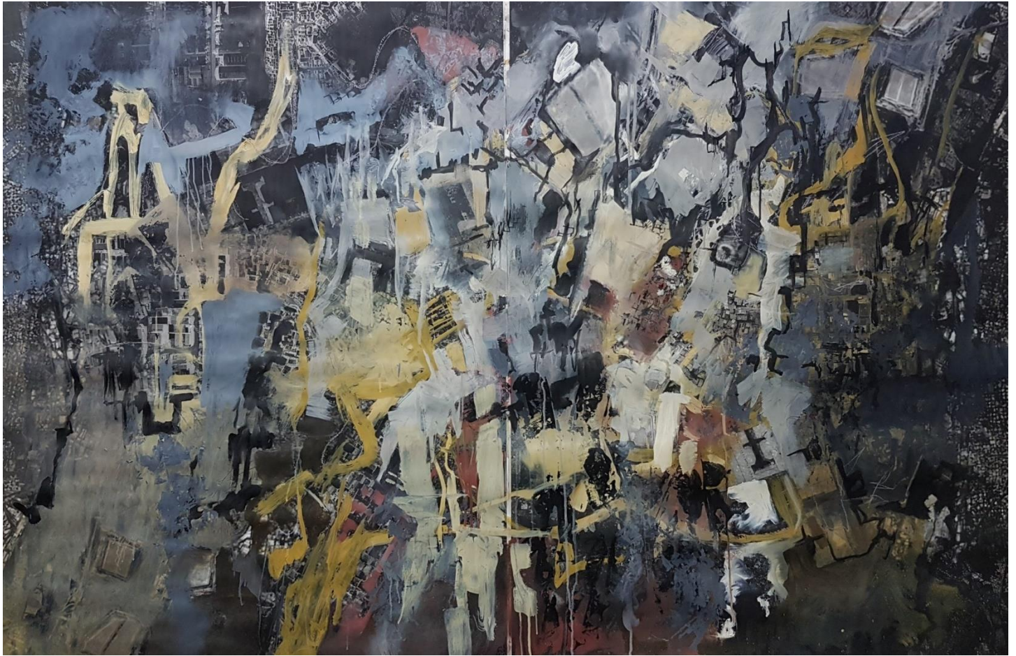
Night Landing: Johannesburg Oil, oxide, crayon, photomontage on sepia paper