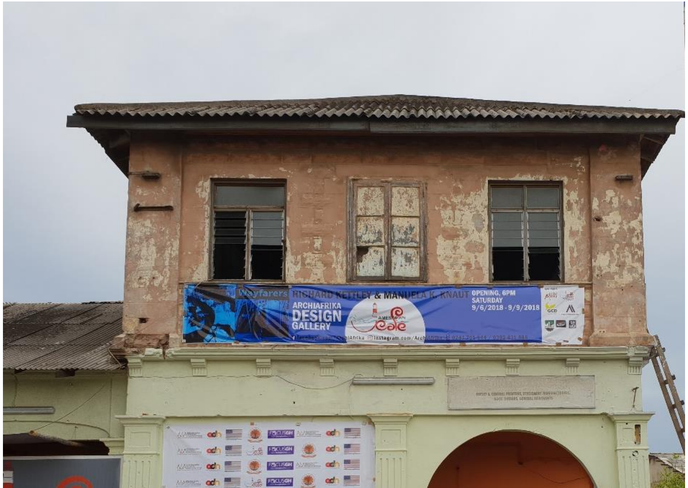
ArchiAfrica Gallery – the upper story of a historic Ussher Town colonial era building. View from the John Atta Mills High Street