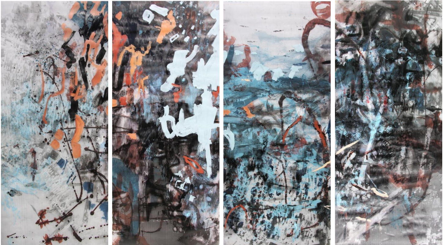
Wayfarers panel I (rear view), Acrylic, charcoal, photomontage, on sepia film, Four panels 840 mm x 1800 mm