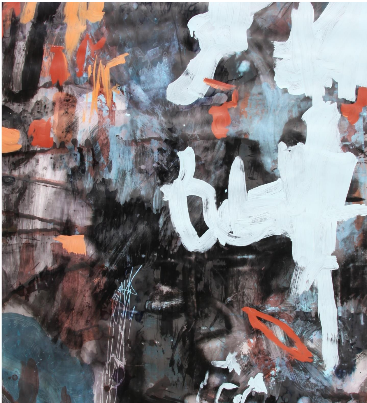
Wayfarers panel I (detail) 840 mm x 1800 mm