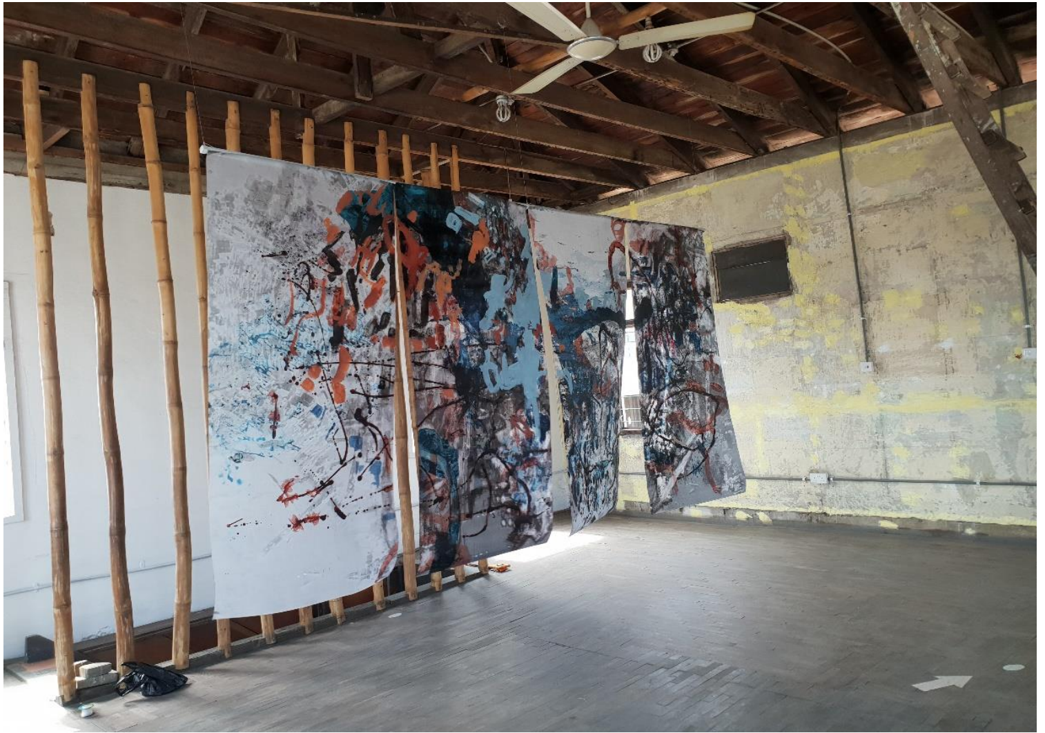
ArchiAfrica Gallery – entrance from below and the street, showing Wayfarers panel moving in the breeze