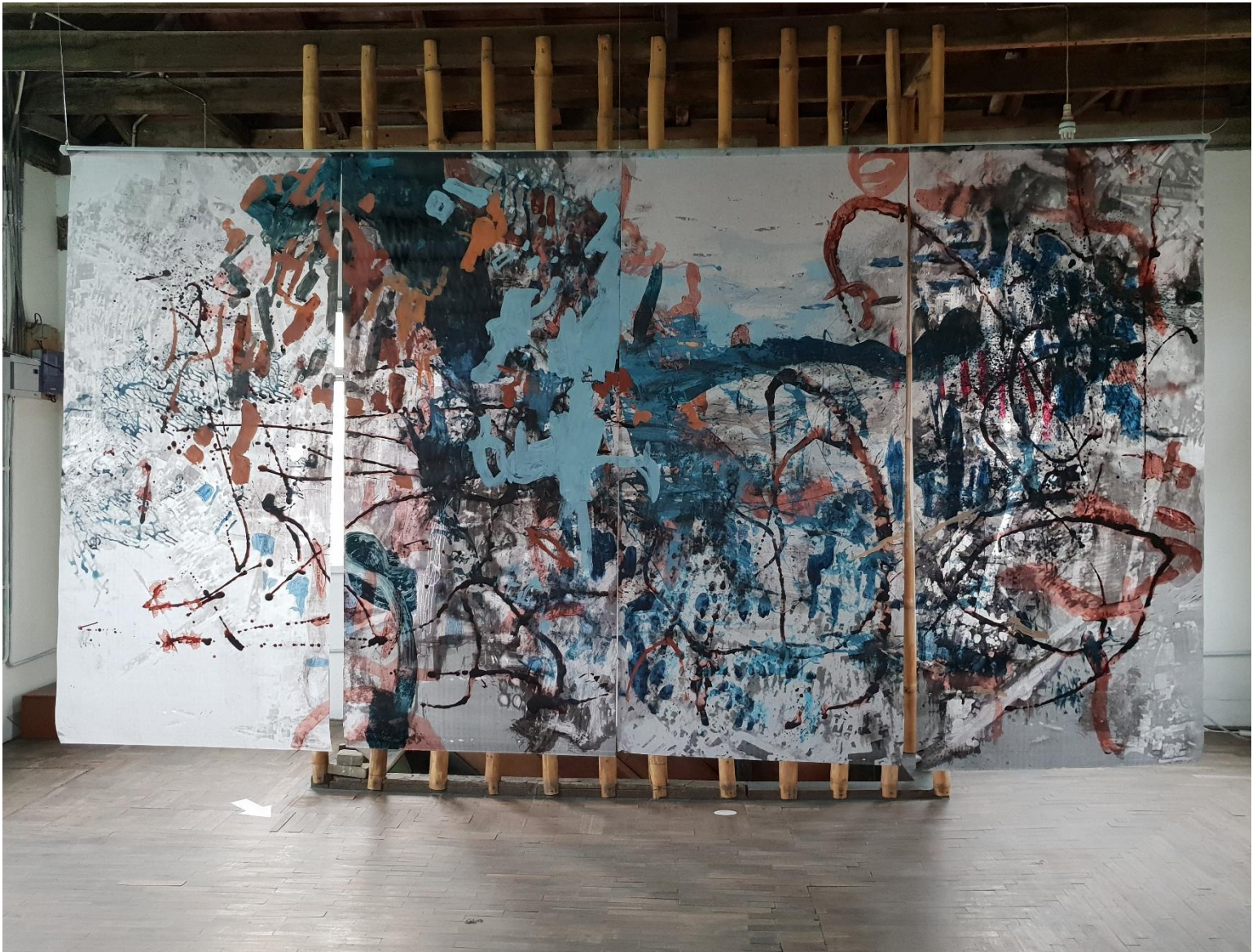
Wayfarers panel I (rear view) in situ, Acrylic, charcoal, photomontage, on sepia film, Four panels , 840 mm x 1800 mm