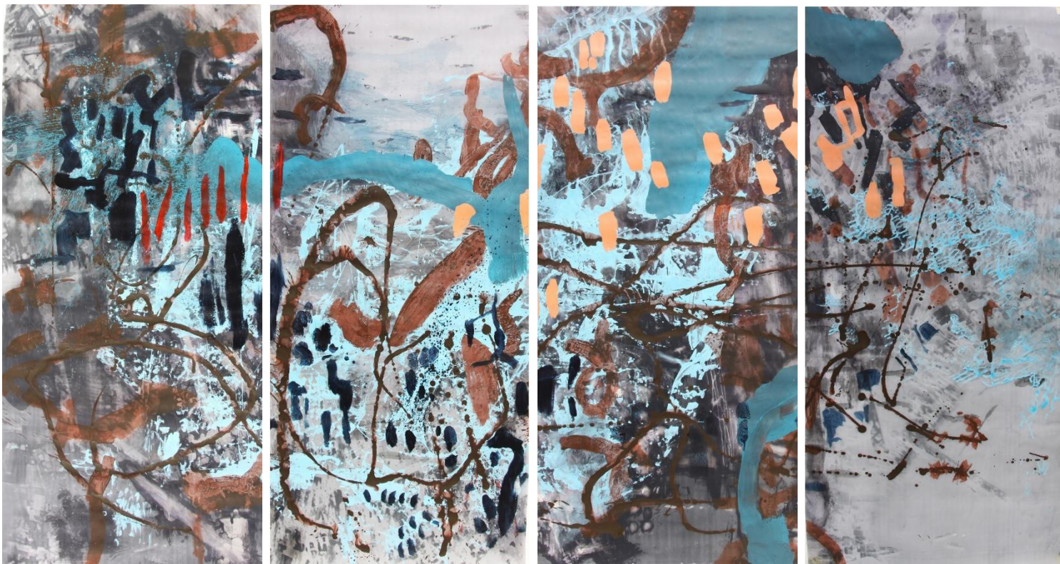
Wayfarers panel I (front view), Acrylic, charcoal, photomontage, on sepia film, Four panels 840 mm x 1800 mm